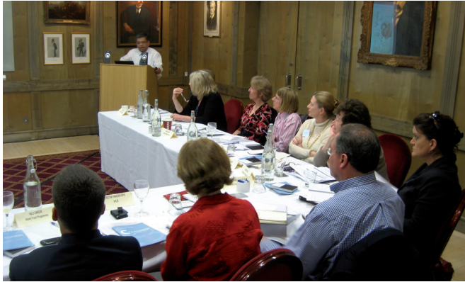
Participants at the Early Origins of Health meeting

C3 is working with Novo Nordisk, Johnson & Johnson and PepsiCo in exploring the early origins of health, focusing on young girls, pregnant women and young children. There is growing evidence that the first 1,000 days of life (from conception up to the age of two) have a crucial impact on health in later life. A first step has been a meeting of experts and like-minded companies, organised by C3, to examine the emerging evidence base and set priorities for sustainable change. The meeting brought together expertise from a wide range of areas including nutrition, maternal health, child health, the empowerment of women and community engagement.