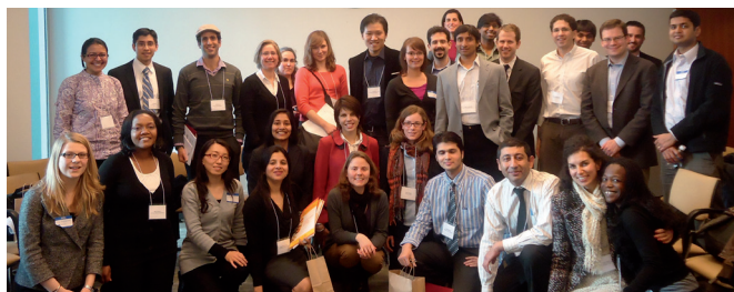
Young Professionals Chronic Disease Network meets in Boston